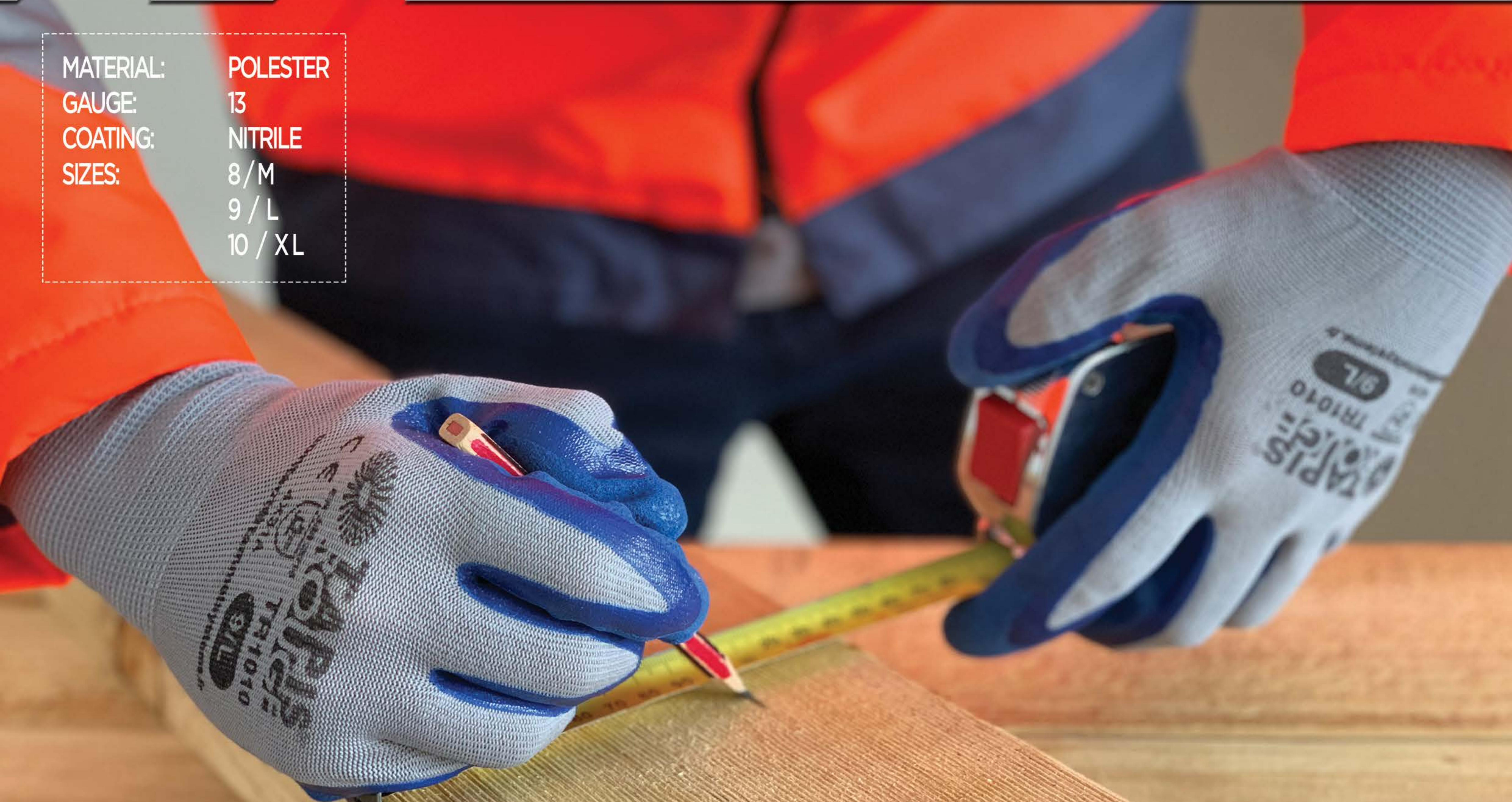
Available Coating colour

MATERIAL: POLESTER GAUGE: 13 COATING: NITRILE SIZES: 8/M 9/L 10/XL